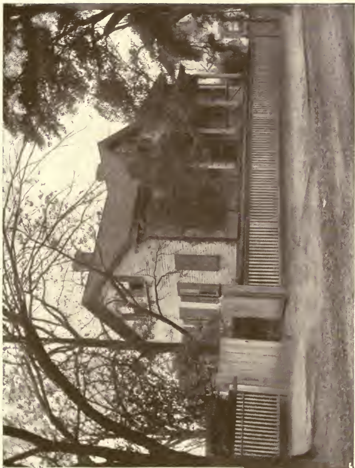
MRS. CHESNUT'S HOME IN COLUMBIA IN THE LAST YEAR OF THE WAR.

Here Mrs. Chesnut entertained Jefferson Davis.